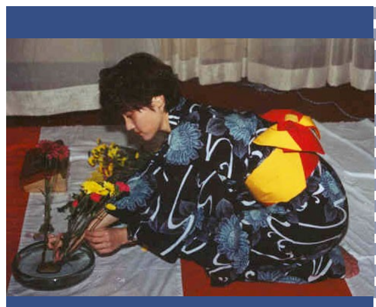
Japanese Tea Ceremony