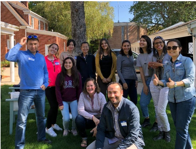
ISC participants and coordinators at one of their first meetings this semester