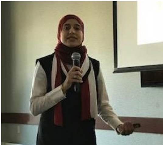
A student speaker from Egypt addresses a community group in early 2019