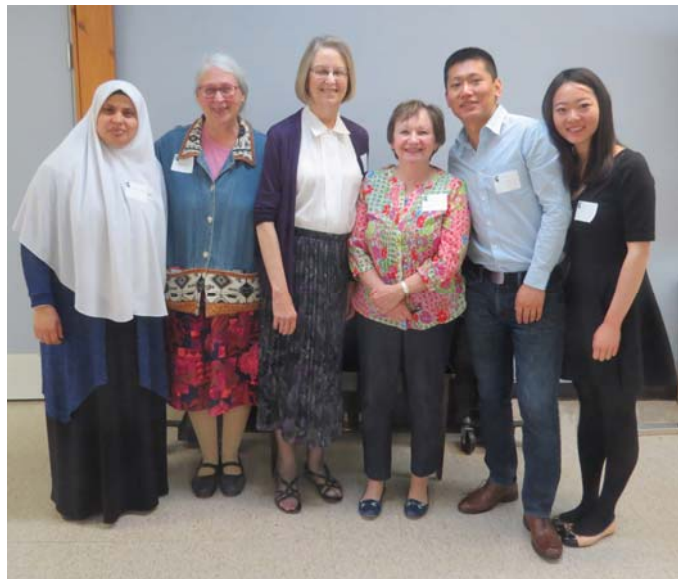
2015-2016 Scholarship Recipients